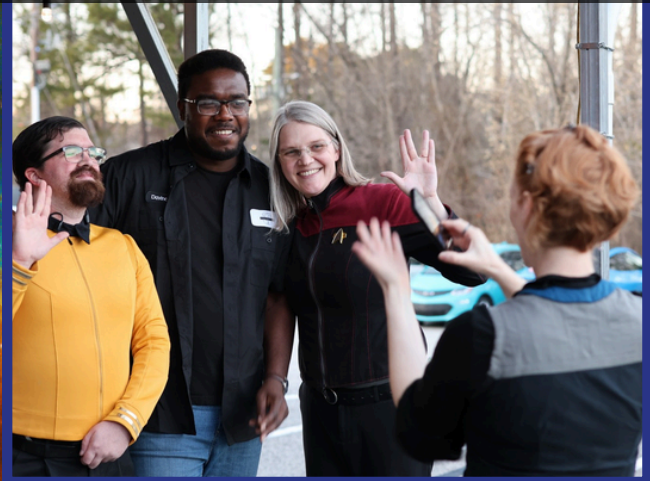
Feb 28 th - Terminus makes friends (with the pizza delivery person) wherever they go!

A large group gathered at Viking Alchemist Meadery to share in camaraderie and cheer on new recruits as they bent their brains to completion of their Academy exams! We look forward to some upcoming promotions!